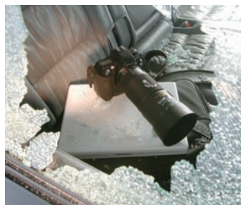
WITHOUT SECURLUX® FILM

On the basis of up to three break resistant layers and the reliable bonding of the film with the window pane, the glass no longer shatters into a thousand splinters from an exterior forced impact. The window pane equipped with SECURLUX® remains intact in the frame. Tests have shown that the SECURLUX® car window film resists even severe and multiple attacks with a variety of burglar tools.