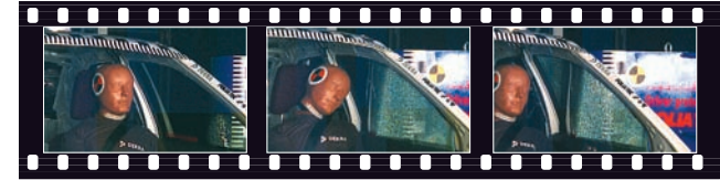
The test with the SECURLUX® safety film provides conclusive evidence for the protection from glass splinters. The side impact breaks the glass, but it remains intact in the window frame. Thanks to SECURLUX® there are no glass splinters that penetrate the interior and pose a risk of injury to the occupants.