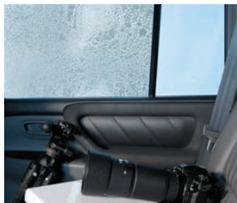
WITH SECURLUX® FILM

On the basis of up to three break resistant layers and the reliable bonding of the film with the window pane, the glass no longer shatters into a thousand splinters from an exterior forced impact. The window pane equipped with SECURLUX® remains intact in the frame. Tests have shown that the SECURLUX® car window film resists even severe and multiple attacks with a variety of burglar tools.