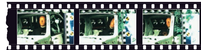
In the DEKRA test center a side impact is simulated without SECURLUX®. In the test it is evident that the side window breaks into a thousand glass splinters and that they enter the interior of the vehicle. They represent a high risk of injury to the occupants of the vehicle.